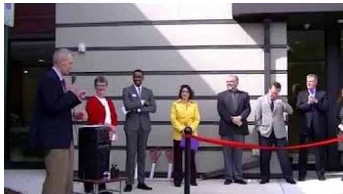
Briarpatch celebrates the opening of its Youth Shelter, the first of its kind in Dane County.