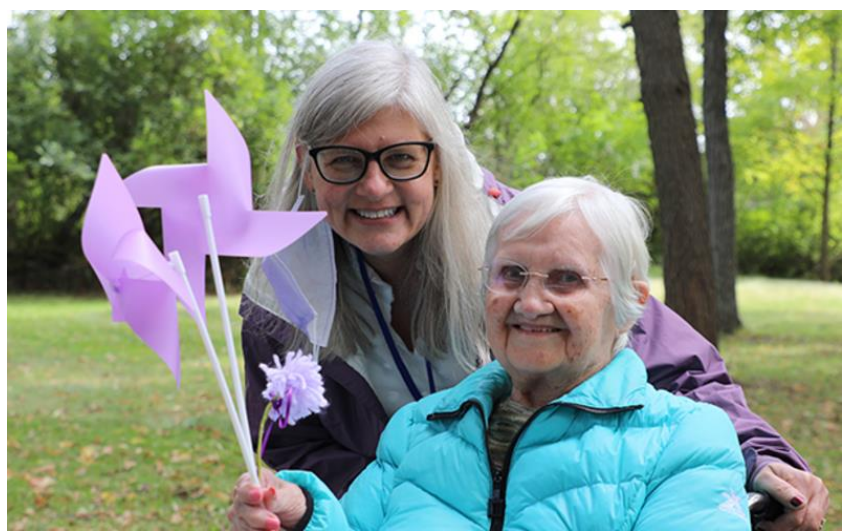
THREE PILLARS RESIDENT ENJOYING THE BEAUTIFUL SURROUNDINGS