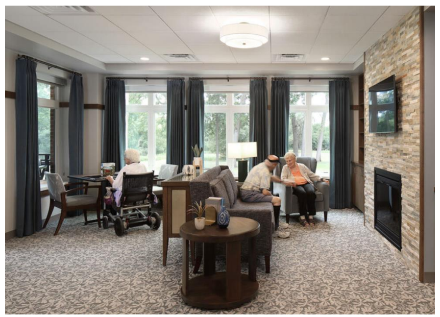
NEWLY RENOVATED COMMON AREA

This position is not just a job; it's an opportunity to be part of Three Pillars mission to support older adults.