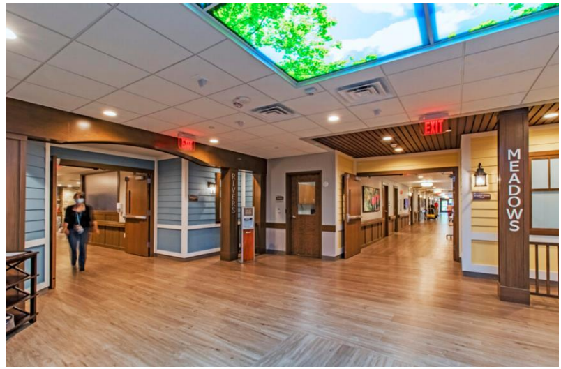
NEWLY RENOVATED HEALTHCARE SERVICES COMMON AREA