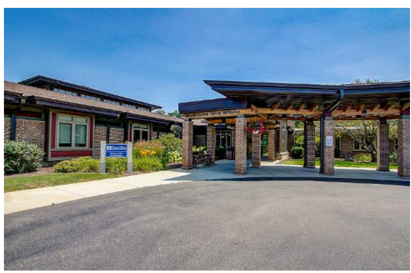
ENTRANCE TO THREE PILLARS REHABILITATION CENTER