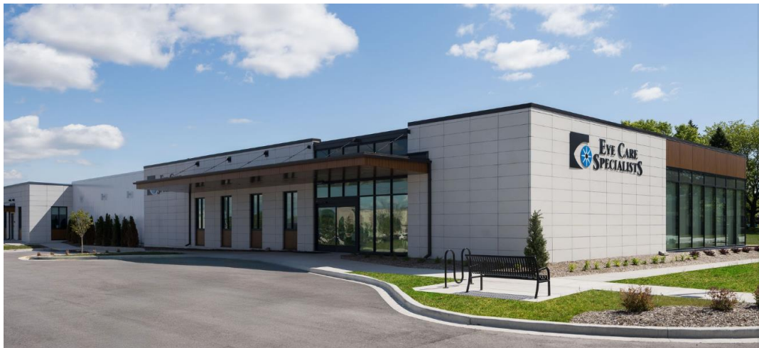
THE NEW STATE-OF-THE-ART WEST ALLIS CLINIC

Eye Care Specialists' Executive Director will serve as the leader responsible for the strategic direction, operational management, and financial sustainability of a high-volume ophthalmology practice with three clinical locations. Reporting directly to the four physician partners, this position ensures the practice delivers high-quality patient care, maintains regulatory compliance, achieves operational efficiency, and is financially sustainable across all locations. The Executive Director will play a key leadership role in fostering a culture of collaboration, excellence, and innovation within the clinical and administrative teams.